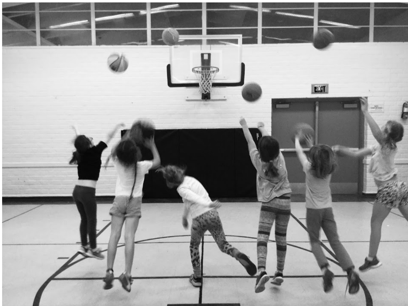
I have always loved children. Growing up as the oldest of four, I learned how to not only tolerate but enjoy the presence of younger kids. Recently, I have had the pleasure of working as an assistant coach on my younger sister's basketball team. These past few months have been such a wonderful learning experience for me. I've really enjoyed being able to mentor young girls in a sport I'm so passionate about.