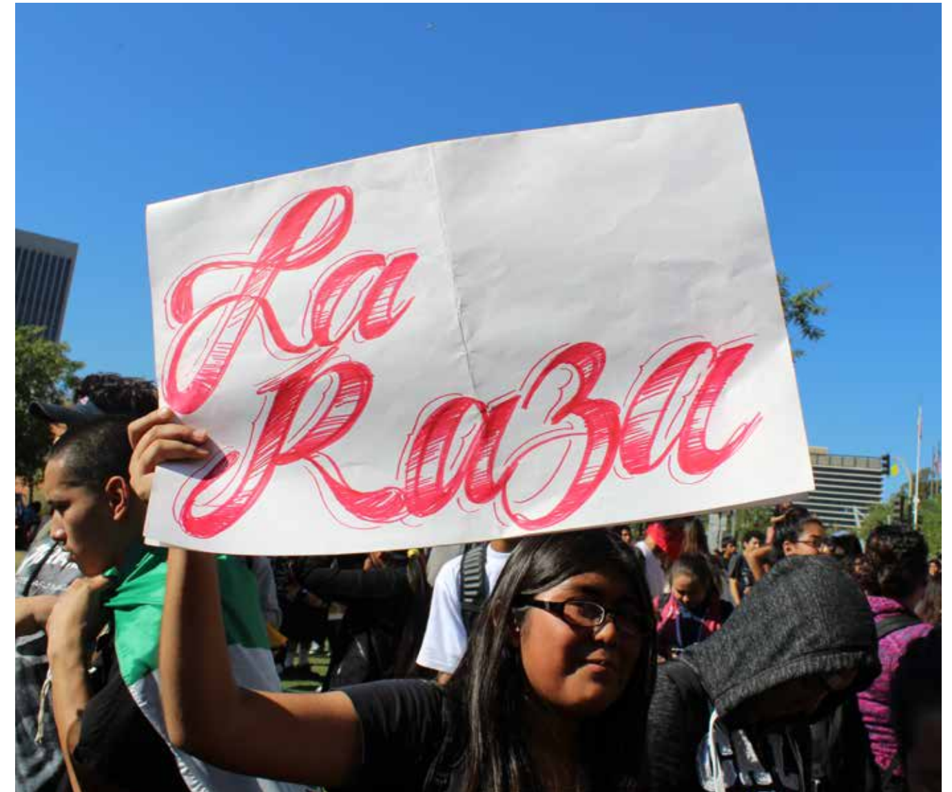
ABOVE