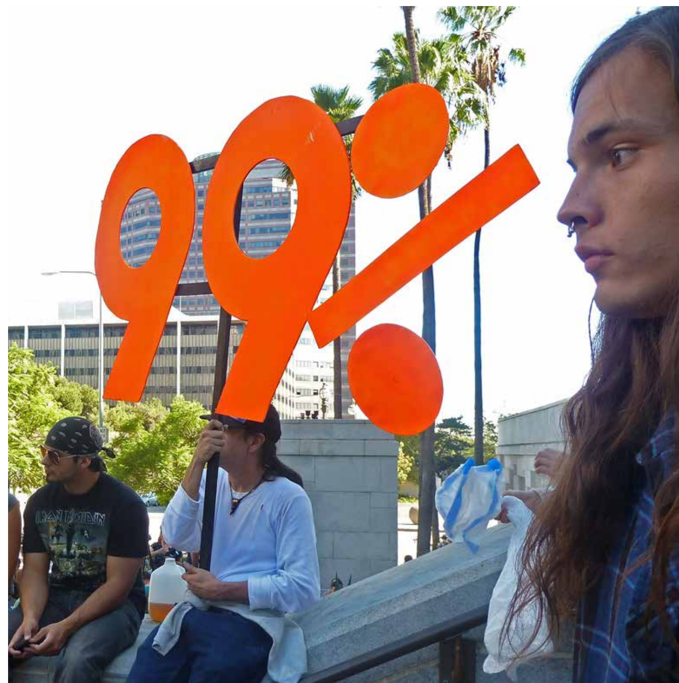
OPPOSITE PAGE, CLOCKWISE FROM TOP LEFT: Photograph by Steve Fine. It's Called the American Dream . Occupy LA City Hall encampment, November 2011. • Photograph by Steve Fine. Corporations Are Not People . Occupy LA City Hall encampment, November 2011. • Photograph by Steve Fine. It's Not A Protest, It's A Movement . Occupy LA City Hall encampment, November 2011 • Photograph by Steve Fine. Fascism: When People Have to go to Wall Street to Protest Their "Government." Occupy LA City Hall encampment, November 29, 2011. ABOVE: Photograph by Steve Fine. (We Are the) 99% Symbol as a Sign (People gathering on north steps of City Hall after the march from Pershing Square). Occupy LA City Hall, Day One, October 1, 2011