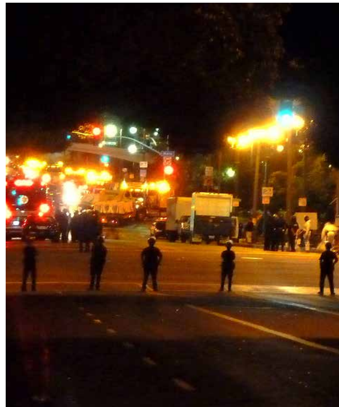
OPPOSITE PAGE, CLOCKWISE FROM TOP LEFT: Meditation on the Power of Money to Gag Free Speech. Occupy LA City Hall encampment, November 2011. • A Union/Occupy LA-Organized March and Rally to City Hall. Occupy LA City Hall encampment, November 2011. • A One-Man Vigil Facing Occupy LA Encampment During the Police Raid. (Unknown vigiler risked arrest for refusing an order to clear the street at 3 a.m.). Occupy LA City Hall encampment, November 29, 2011. • Occupy LA Print Shop: Signs, Banners, Leaflets, T-shirts. Occupy LA City Hall encampment, November 2011. ABOVE: Police Cordon Off City Hall, Concrete Barriers Being Erected at NE Corner. Occupy LA City Hall encampment raided, November 28, 2011.