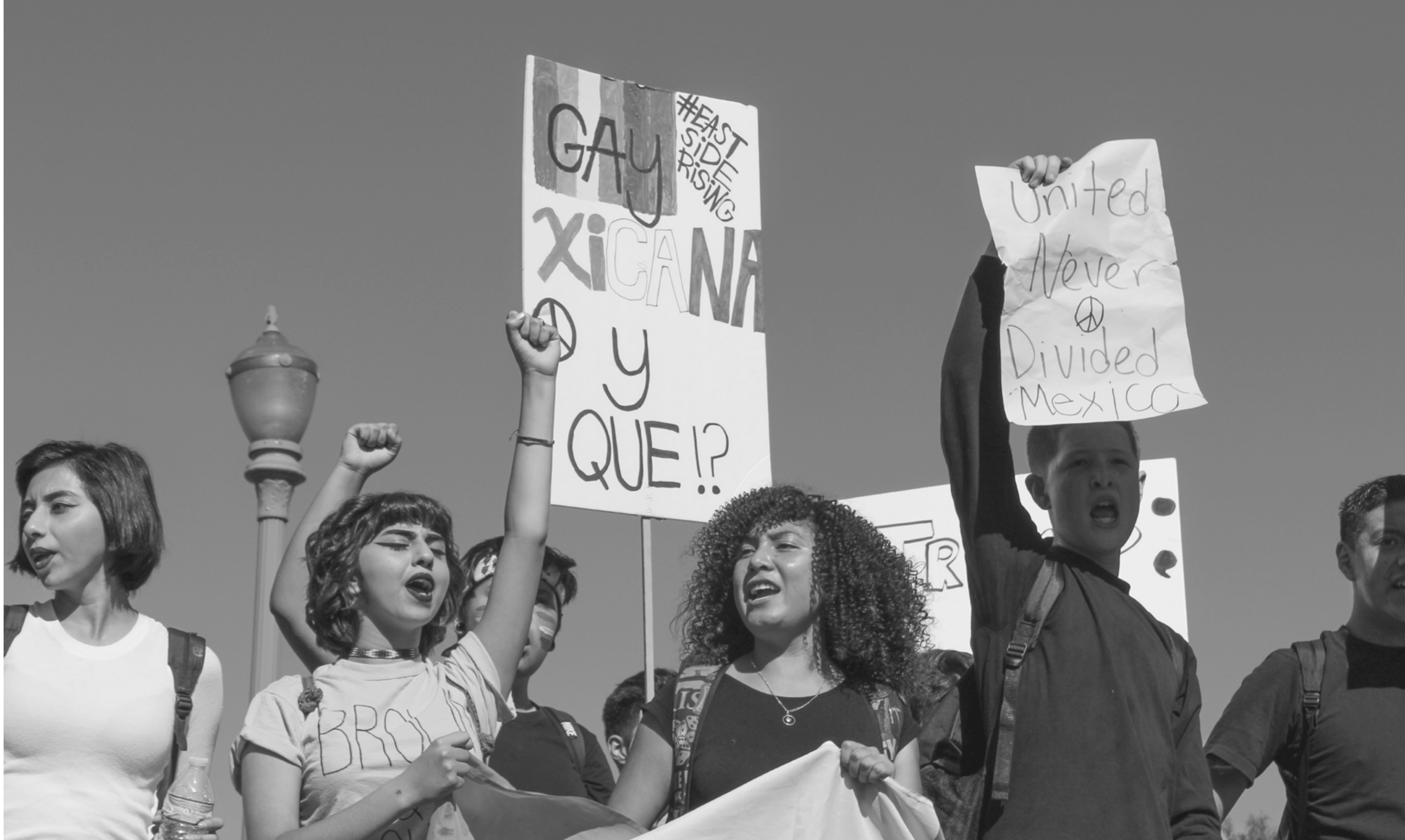
ABOVE: United, Never Divided. This photo was taken at the East Side Rising Walkouts, where we met at Mariachi Plaza to then march towards City Hall. Pictured here are Roosevelt, Garfield, and Torres High School students.