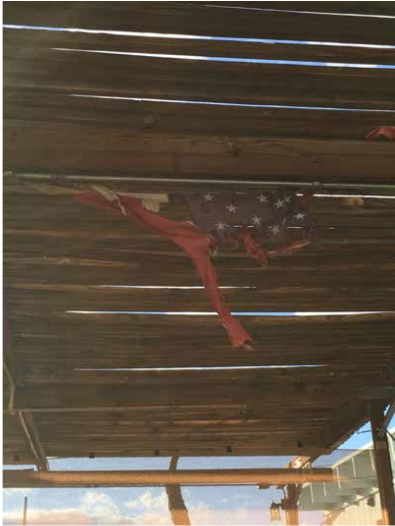
ABOVE: A tattered and worn American flag blows in the wind on someone's porch and with politics today the flag has so many different meanings to different people.