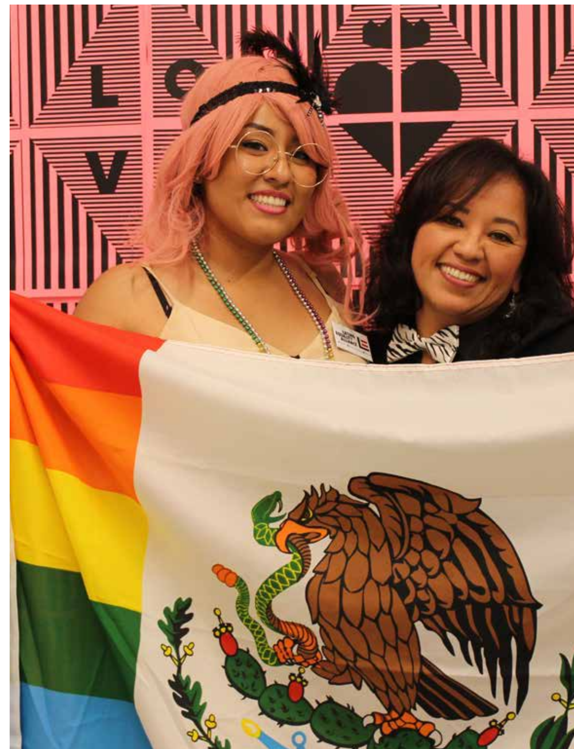
OPPOSITE PAGE, CLOCKWISE FROM TOP LEFT: Bystander, selling hot dogs during a protest against President Trump, on Presidents' Day holds the Mexico flag, as she stands as a proud immigrant. • The NoDapl protest took place at MacArthur Park in the Fall of 2016. People at this protest stood in solidarity with Standing Rock to resist the pipeline, which continues to ruin land and pollute water. • Standing Strong. A shot taken during the historic Women's March in Downtown L.A. A crowd gathered together hold up their signs proudly as they march for what they believe in. ABOVE: At an LGBTQA ball dance, I was in charge of a photo booth. Props were used, like this Mexico/gay rights flag.